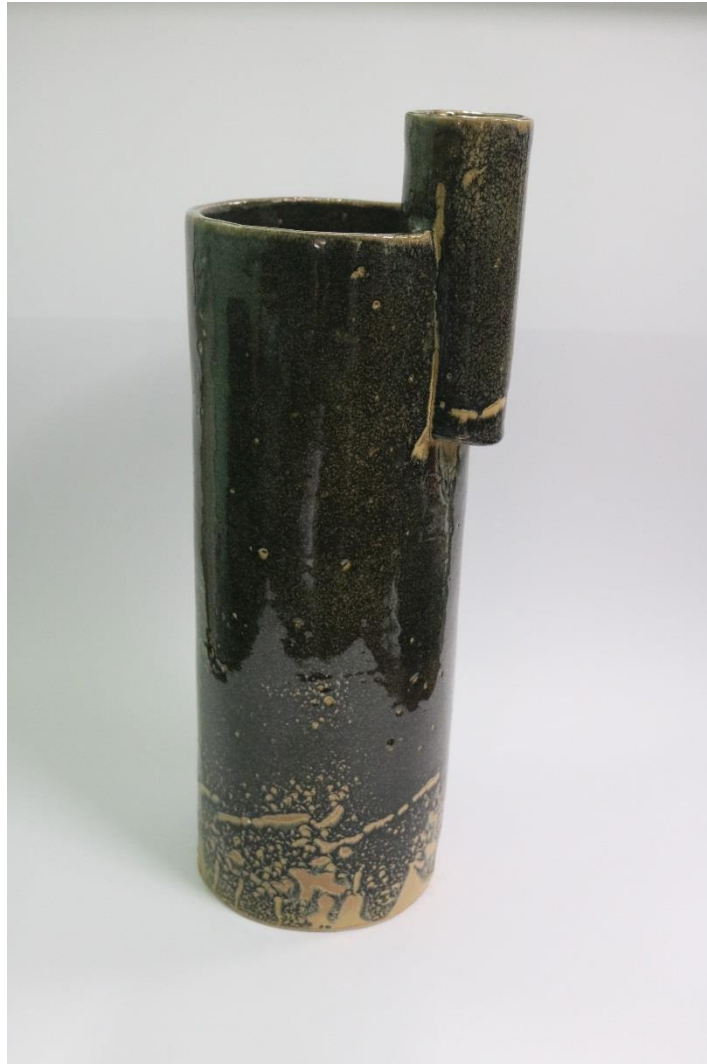
Next Generation 18 x 15 x 43 cm stoneware Joko Lulut Amboro